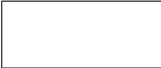
Proof Referral Stamp

Referring Agent Name (If Applicable) _____