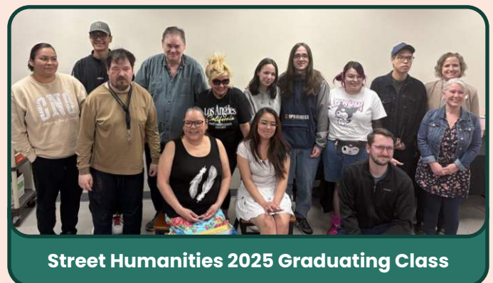
Street Humanities 2025 Graduating Class

It provides a safe, inclusive, and supported learning environment designed to spark interest in further education and foster personal growth and well-being.